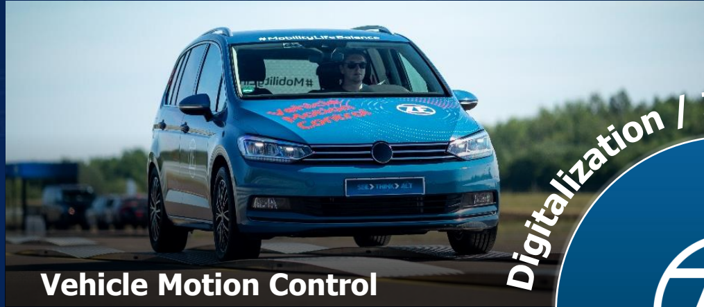
Vehicle Motion Control

الطرق السيارة بالمغرب Autoroutes du Maroc